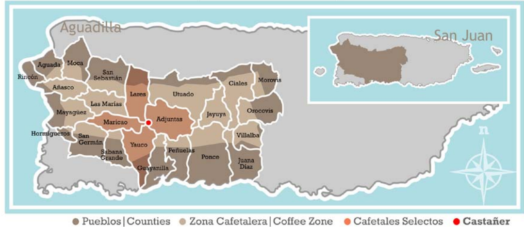
Mapa Zona Cafetalera de Puerto Rico | Puerto Rico Coffee Zone Map

Visit us at www.cafipr.org or write to us at lisettefas@cafipr.org